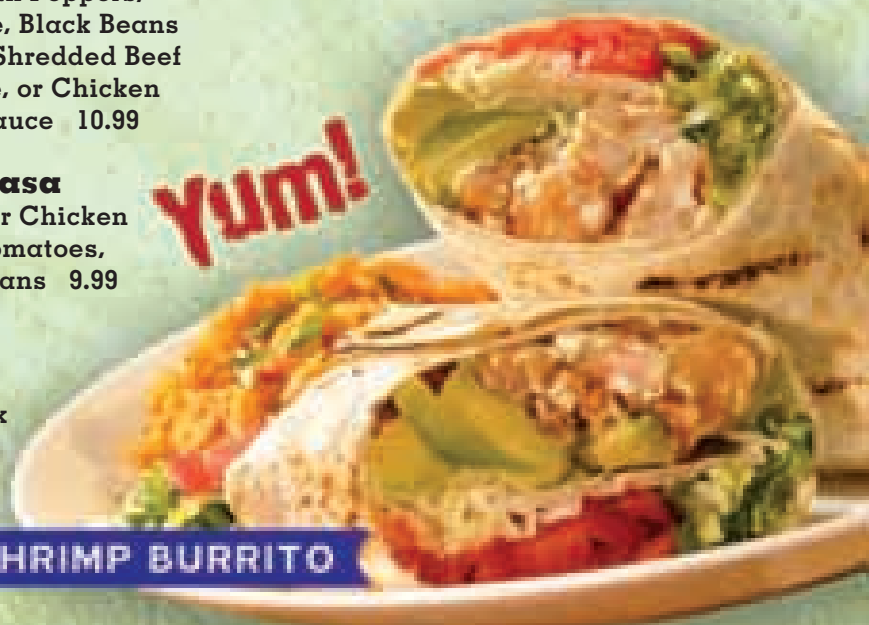
ROCK SHRIMP BURRITO